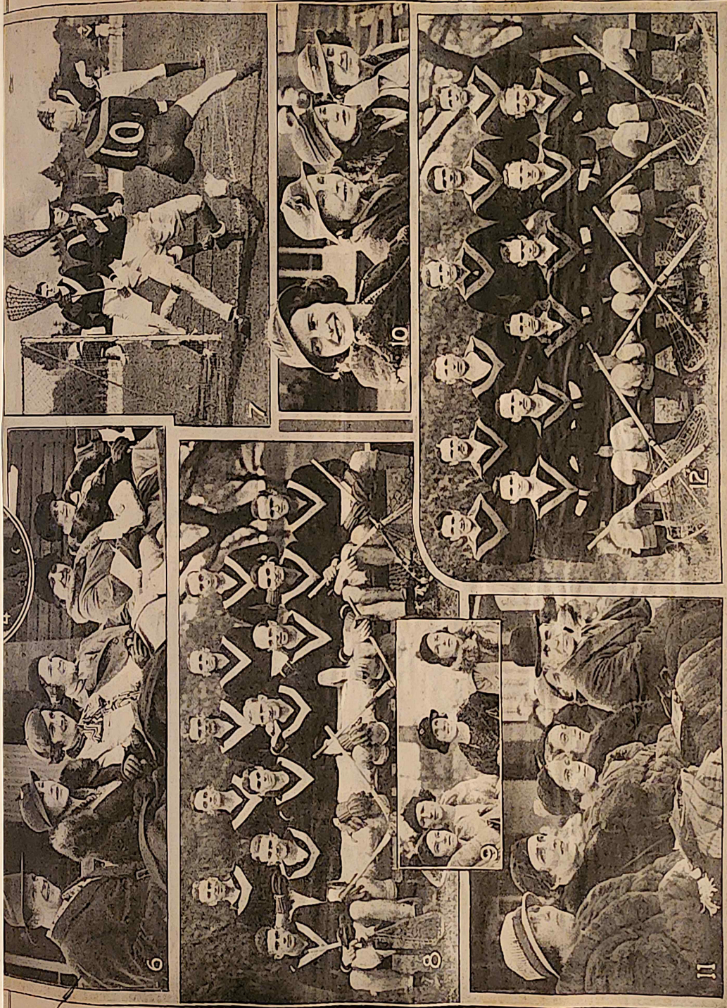
Goal Malvern (Malb. Univ.)