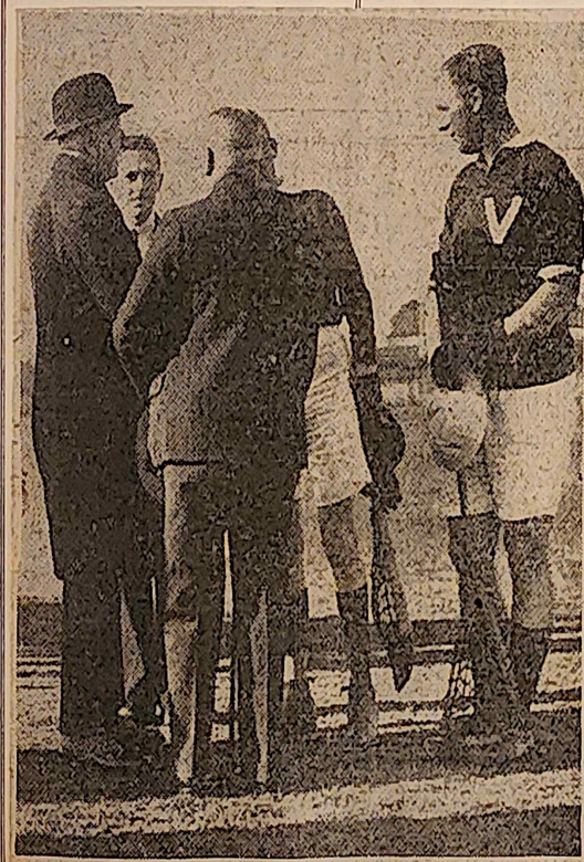
GOVERNOR AT INTERSTATE LACROSSE —The Governor (Sir Alexander Hore-Ruthven) attended the interstate lacrosse match between South Australia and Victoria, played at the Unley Oval today. He is pictured here meeting some of the Victorian team.