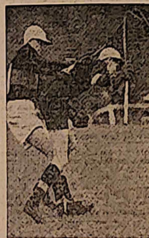
MALVERN DEFEATED M.C.C. by five goals in the grand final lacrosse match which was played on the Amateur Sports Ground on Saturday. An incident in the game.

Malvern, except for the years when Hawthorn, Brighton (twice), M.C.C. and