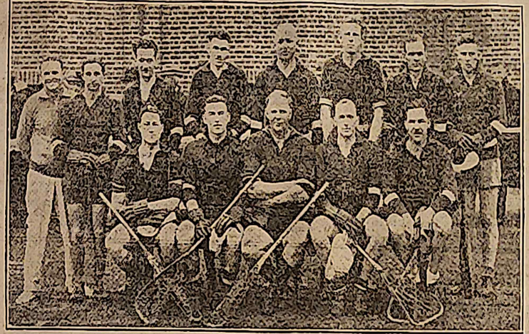
Melbourne Cricket Club's Lacrosse Team which defeated Malvern 9 Goals to 7 Goals in the final of the Senior Section of the Lacrosse Premiership on Saturday.

As Malvern has the right of challenge, there will be a grand final next Saturday.