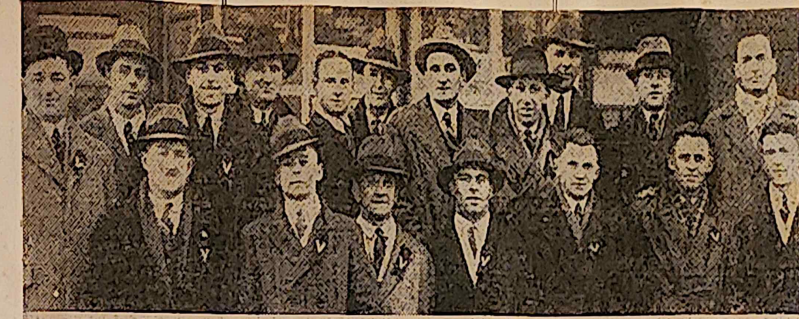
VICTORIAN LACROSSE PLAYERS HERE: A picture taken after the arrival by the Melbourne express today of the Victorian lacrosse team, which will meet South Australia at the Unley Oval tomorrow.

"The News" Adelaide Sat' Aug. 5 th . 1933