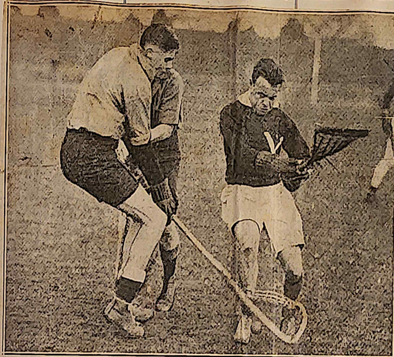
A TENSE MOMENT in the combined Universities' (Melbourne and Adelaide) match against the Victorian Lacrosse Association team. The struggle for the ball is between the Universities' goalkeeper and a Victorian player in the third quarter.