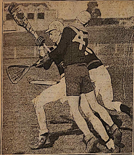
INTER-UNIVERSITY LACROSSE.—A tense moment in front of the Adelaide goal in the second quarter.