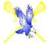
West Torrens Lacrosse Club