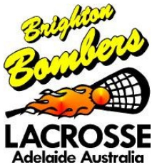
Brighton Lacrosse Club