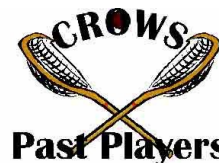
Crows Past Players Lacrosse Club