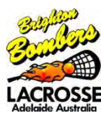
BRIGHTON LACROSSE CLUB