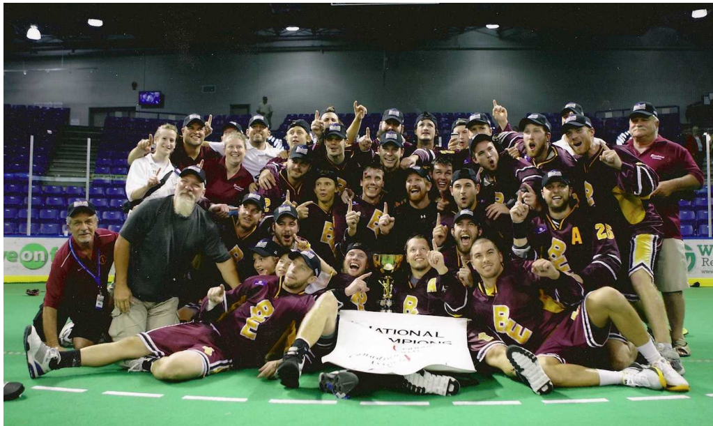
Brampton Sr. Excelsior LC, Canadian Mann Cup Champions, 2011

(1992, 1993, 1998, 1999, 2001, 2002, 2003, 2008, 2009 & 2011) and seven more Canadian Mann Cup championships (1992, 1993, 1998, 2002, 2008, 2009 & 2011).