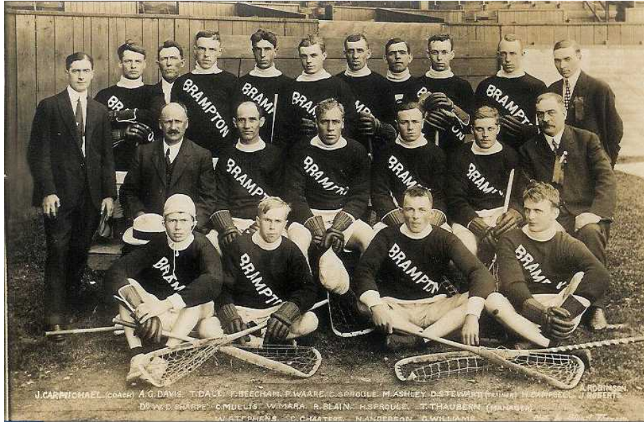
Excelsior Lacrosse Club, Brampton, Ontario's Globe Shield Champions, 1914

club teams routinely travelled from Québec and Ontario to British Columbia and vice versa. The Ontario Amateur Lacrosse Association (OALA) was organized in 1913 by the amalgamation of the Canadian Lacrosse Association and the Ontario Lacrosse Association. The Globe Shield, emblematic of senior series amateur lacrosse supremacy in Ontario at the time, was captured by the senior Excelsiors in 1912, 1913, and 1914. The Shield was retired in 1938 and is on display at the Ontario Lacrosse Hall of Fame in St. Catharines.