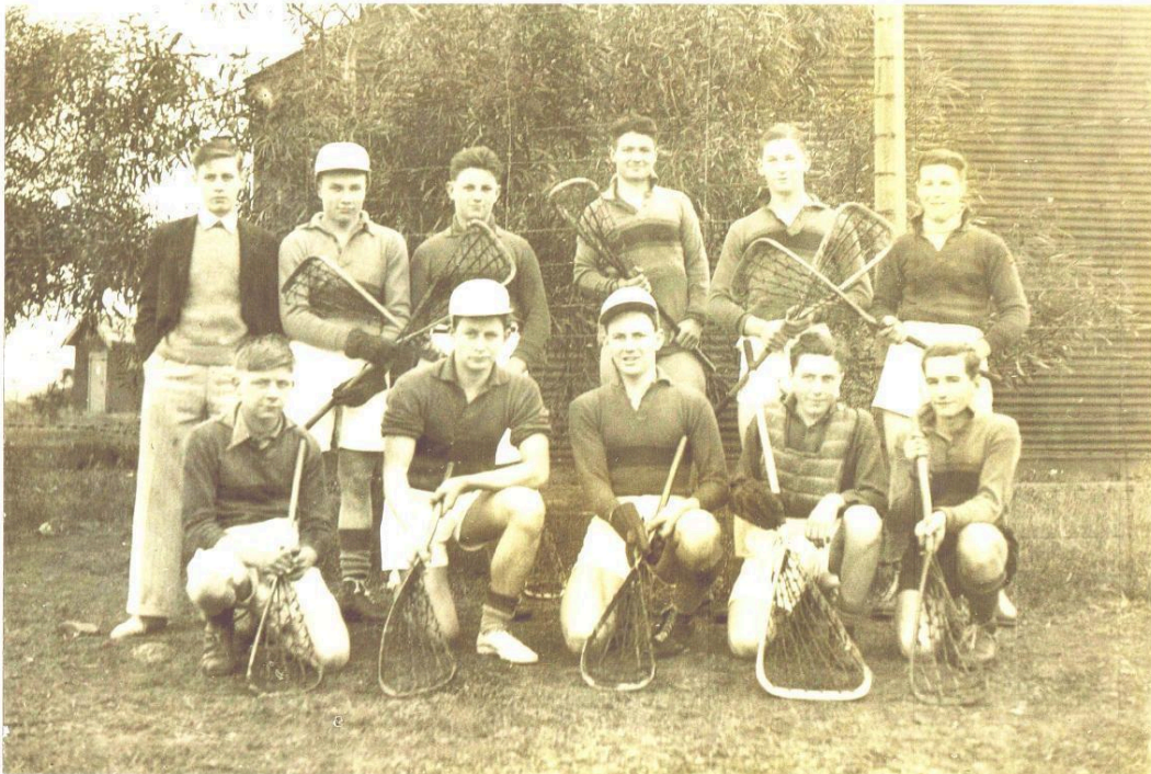
FOOTSCRAY LACROSSE TEAM 1938

The club entered a team in E grade in 1935 and again in 1936, where it finished 11th on the ladder with 4 wins. There are no records of events of 1937 but in 1938 the E grade team finished second on the ladder to Power House and the F grade team and the F grade team finished 7th. In 1939 the E grade team finished second on the ladder to Wattle Park (Which also entered the competition in 1935).