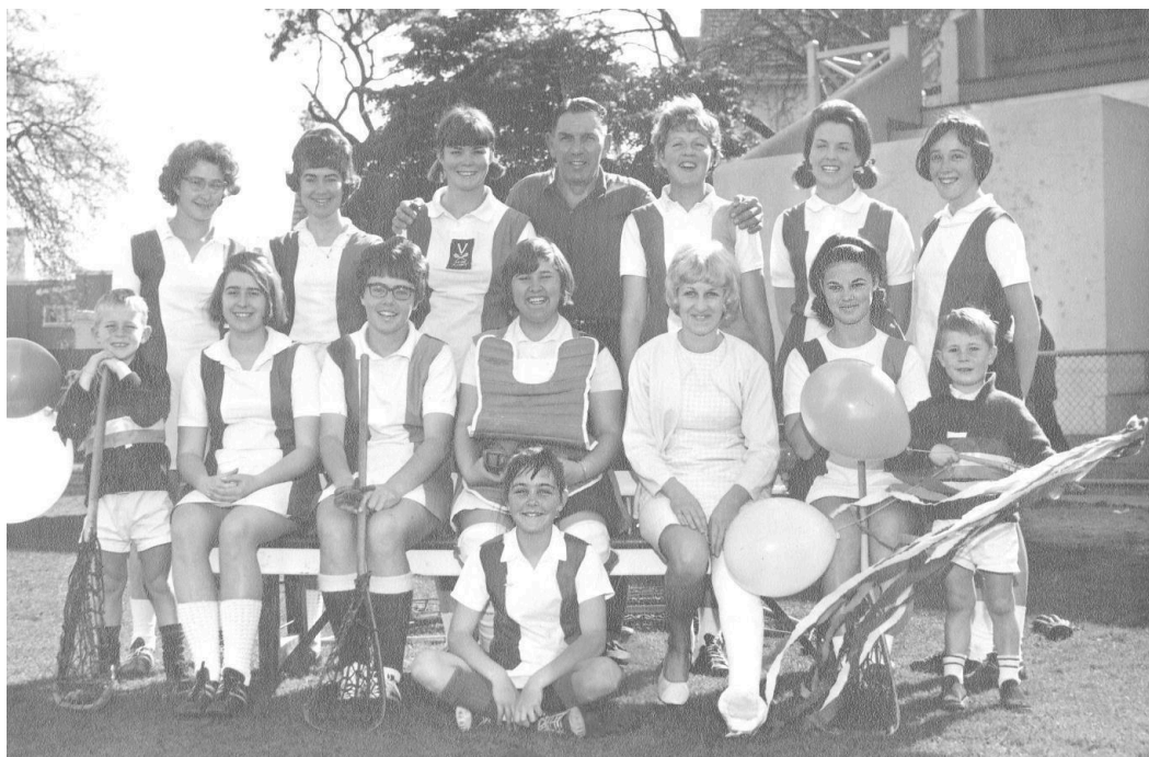
Footscray Women's team 1965 A Grade runners up, defeated by Williamstown

Footscray Players featured prominently in senior Victorian teams throughout the late 1960's and early 1970's.