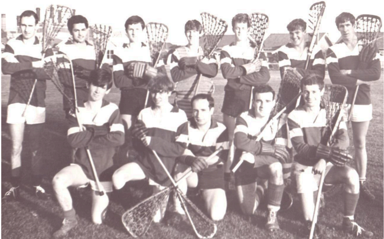
Senior men's team 1966 (Photo taken 30 July)