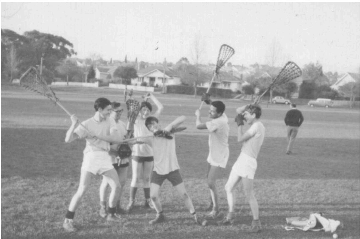
A bit of play acting at practice circa 1964 – T shirts not jumpers!

As resources were very limited, the club adopted blue T shirts as match jumpers for seniors & juniors. Bob Southall subsequently designed and had made the green and white version of the jumper which is still in use today.