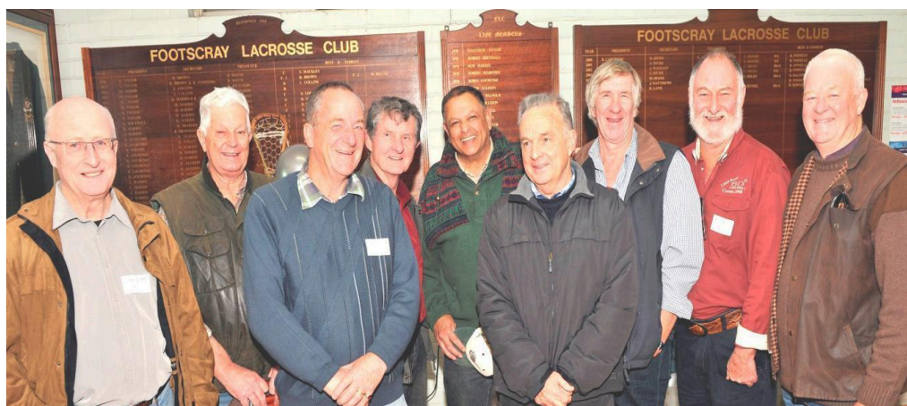
Players from 1961 – 50 Year Anniversary Day – 2011