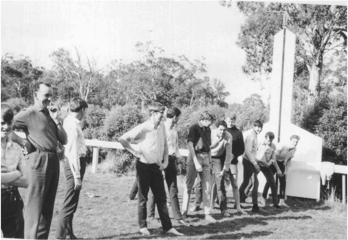
At the starting line for the "Gift" at Hanging Rock!