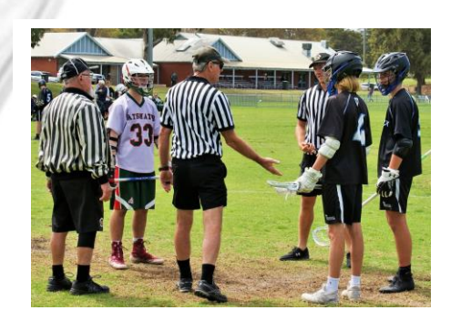
2020 Men's U15 Grand Final – Bayswater vs Phoenix

In 2020 there were 16 ALRA referees available. We lost one to work commitments and another to injury. 5 people joined as Club Referees and officiated in D3 matches before their own D2 or SL games.