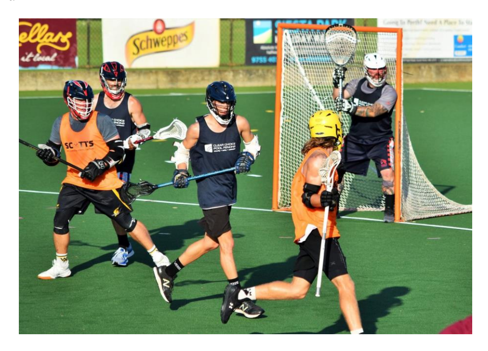
2020 Re-Lax Down South Tournament

With what seemed to be a strong start to the year, LWA looked to be in good stead to focus on developing our sport. The conference held by the ALA for Member Associations early in the year, was constructive and meetings with our local government produced multiple avenues for us to look towards. This was all put on hold with restrictions put in place due to COVID19. From that point onwards, all our time and effort was spent attempting to get the 2020 season up and running whilst abiding by all the restrictions and guidelines placed upon us by the WA Government and WA Health Department.