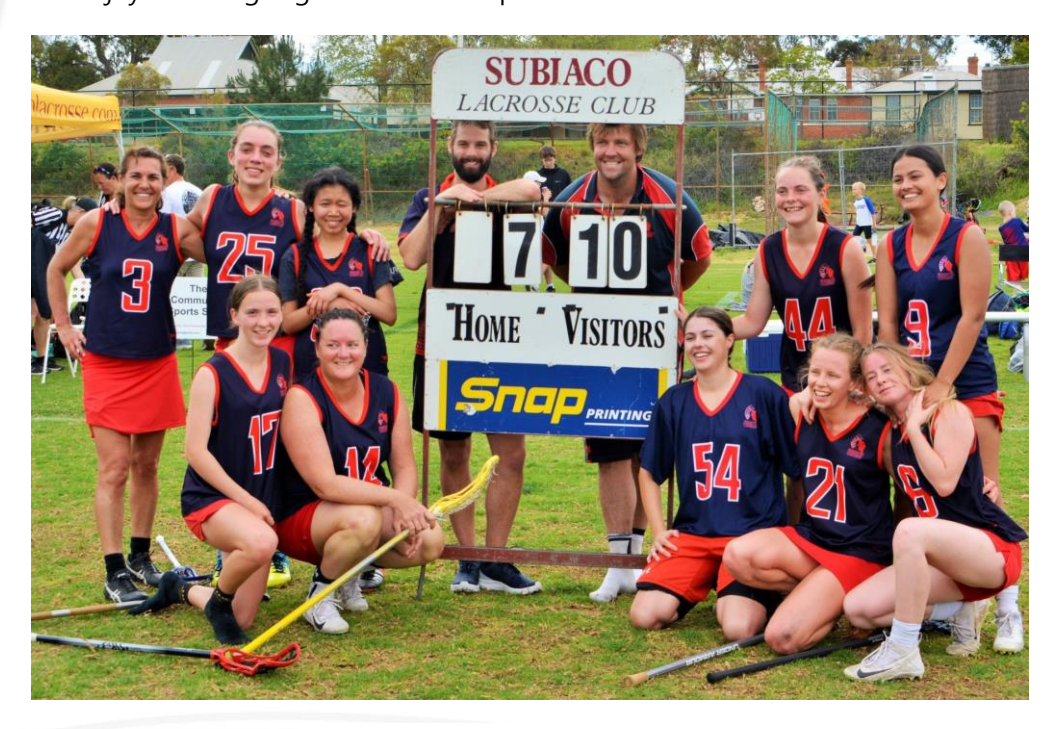
2020 LWA Women's Division 2 Premiers

As this year comes to a close, I am extremely proud and privileged to be a part of WJLC and continue to enjoy watching it grow and develop.