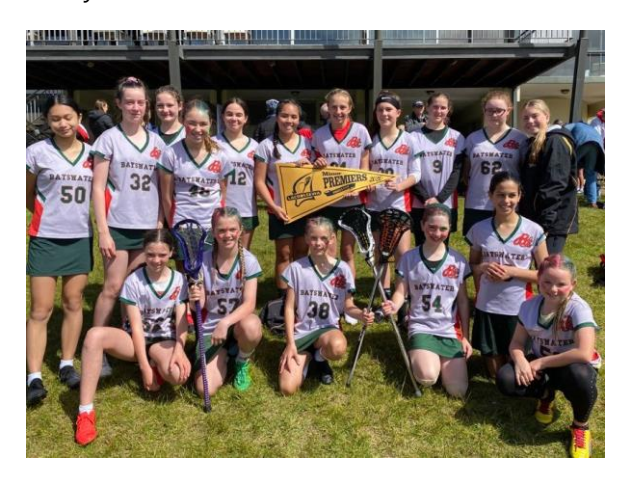
2020 Women's U14 Minor Premiers

As a committee, there was a high focus in keeping costs to a minimum, looking for sponsorship, being positive in our predictions of getting our bar and canteen back up and running