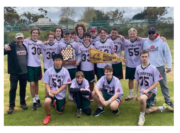
2020 Men's U17 Minor Premiers

and basically, any opportunity that may create savings for our club. We were thrilled with the willingness of our regular sponsors, along with a couple of new sponsors to continue to support