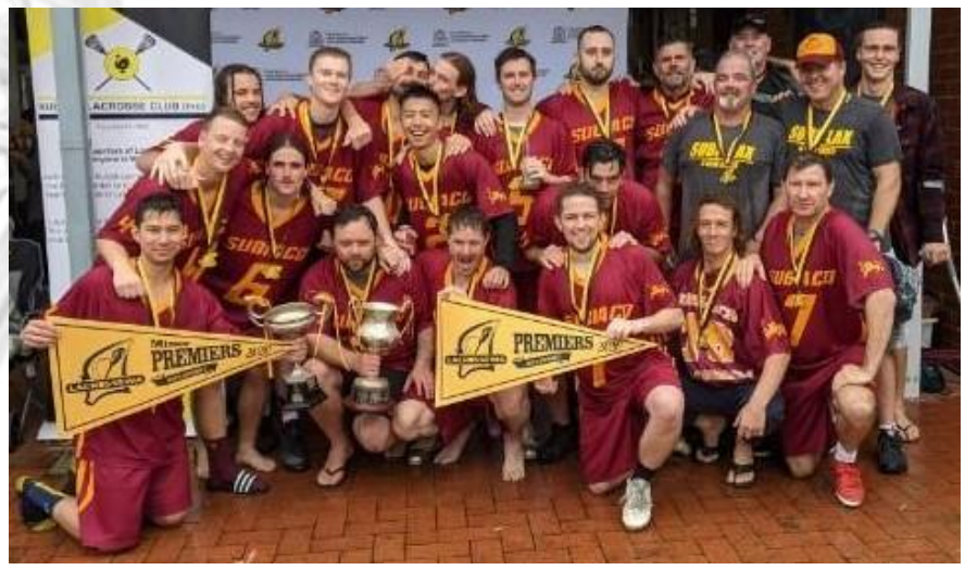
2020 Men's Division 2 Premiers and Minor Premiers - Subiaco