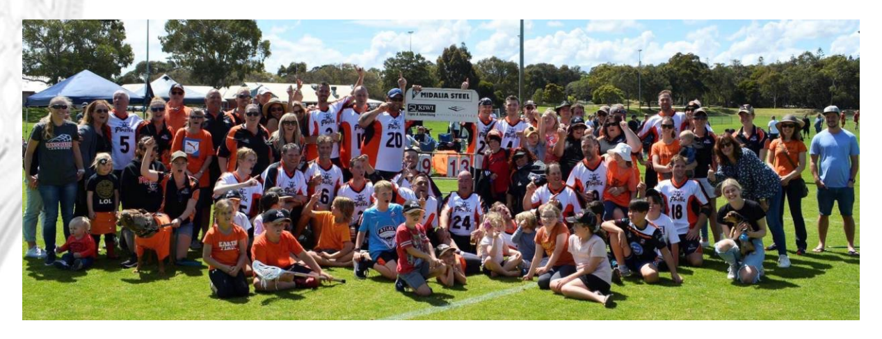
2020 Men's Division 3 Premiers – Alkimos "Pirates" Lacrosse Club

I don't think they have yet won a game, but I do think the kids in this grade are loving the game and they keep coming back for more. Just hoping to retain and develop these kids into the future.