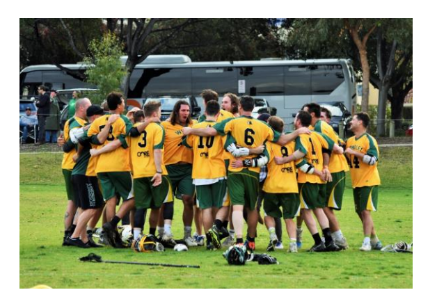
2020 LWA Men's and Women's State League Premiers