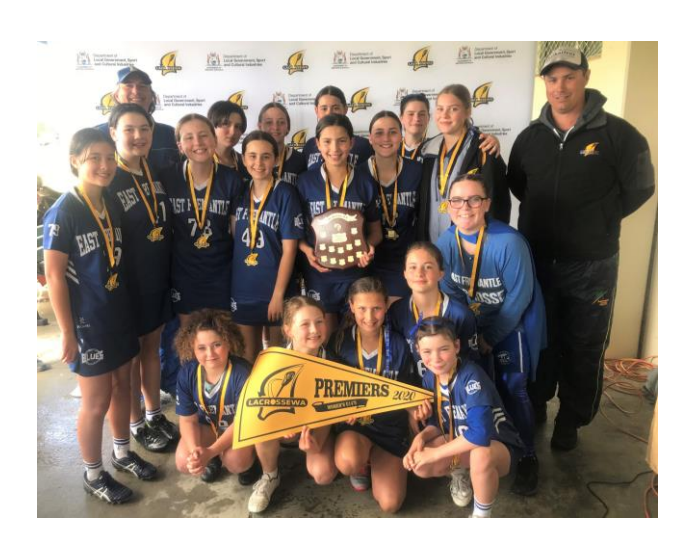
2020 Women's U14 Premiership Team – East Fremantle