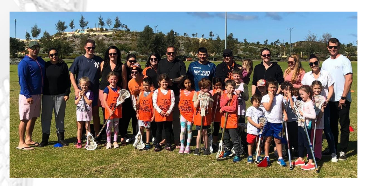
2020 Alkimos U9's

As things were looking more promising I attended a zoom meeting with my fellow Presidents from all WA clubs and we discussed the possibilities of a season and what it would mean for each club. We didn't paint a pretty picture of what a season may do to our club, working from the information at hand and the fact that we didn't even know if there was a second wave on the horizon.