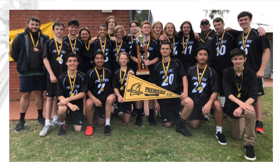
2020 Men's U17 Premiership Team - Phoenix

Ramsay Trophy Greg Wheatley Trophy Jeff Kennedy Trophy