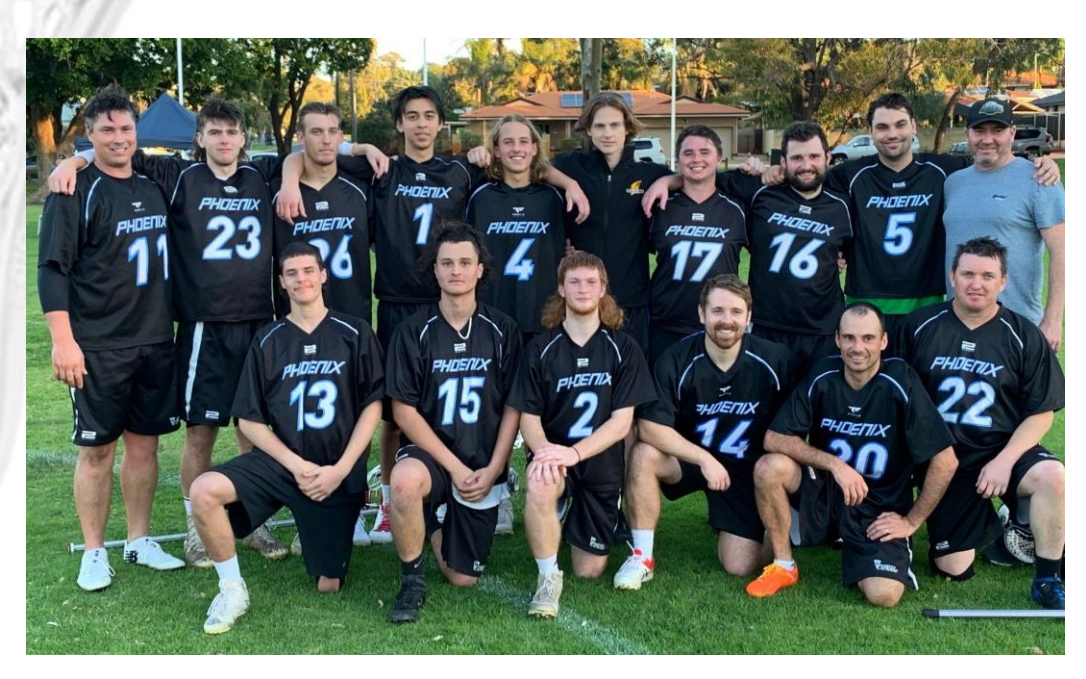
2020 Men's State League Team with guest players from Bayswater LC

City of Cockburn Fremantle Hockey Club Lacrosse WA WA Lacrosse Community