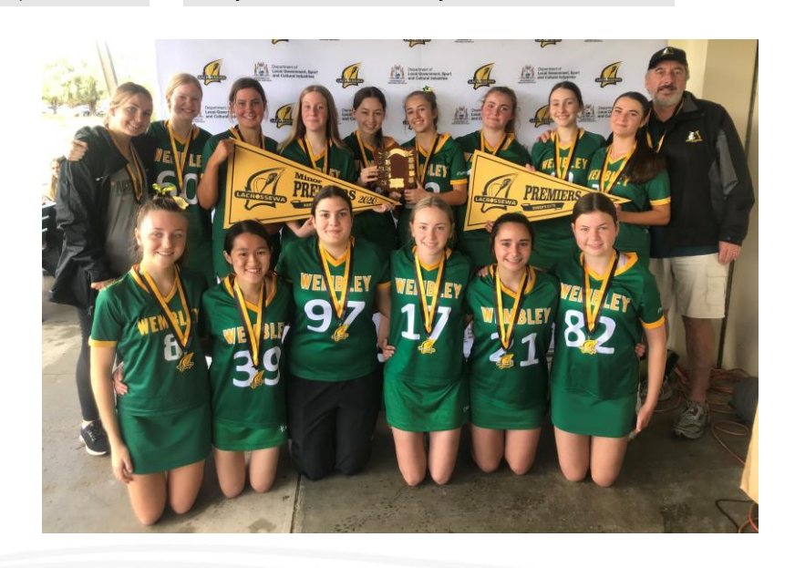
2020 Women's U17 Premiership Team - Wembley