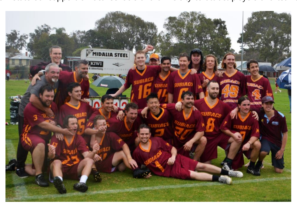
2020 Men's Division 2 Premiers and Minor Premiers