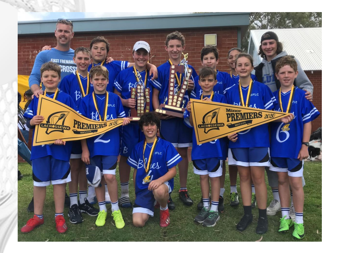
2020 Men's U13 Premiers and Minor Premiers – East Fremantle

Premiers Trophy Minor Premier's Trophy Murray Keen Trophy