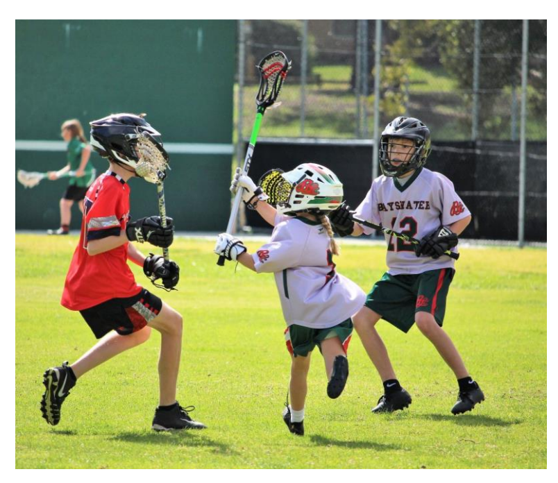
2020 Men's U13's – Bayswater vs Wanneroo-Joondalup