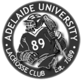
Adelaide University Lacrosse Club