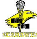
Glenelg Lacrosse Club