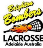
Brighton Lacrosse Club