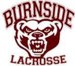
Burnside Lacrosse Club